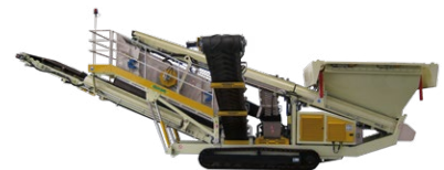
MOBY VAI Series