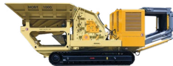
MOBY MASTER Series